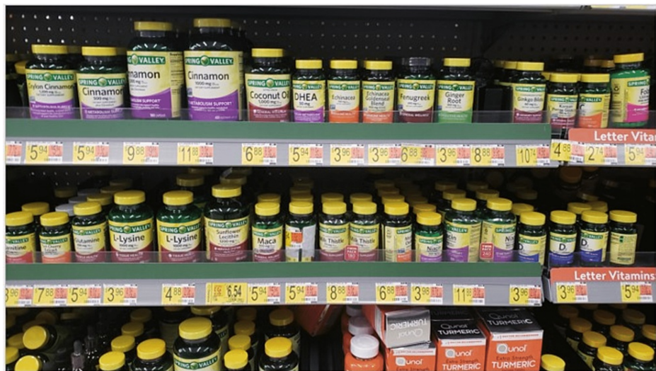
FIGURE 1: Example of mainstream retail channel for herbal supplements: Walmart aisle