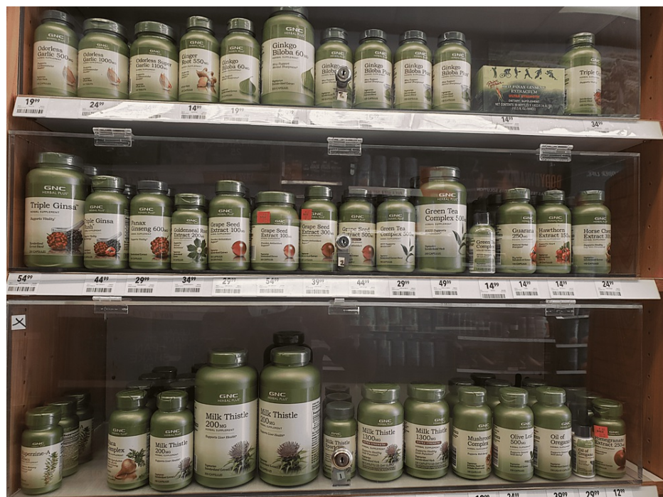
FIGURE 2: Example of natural retail channel for herbal supplements: GNC aisle