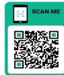
FIGURE 4: Sample patient education material about safety of herbal supplements

https://www.nccih.nih.gov/health/herblist-app